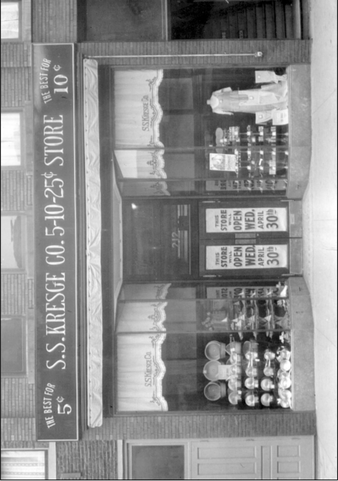
Kresge's Five-and-Dime was located at 212 South Barstow Street. Kresge's has now evolved into modern-day KMart. CVM Collection, Glenn Curtis Smoot Library and Archives.