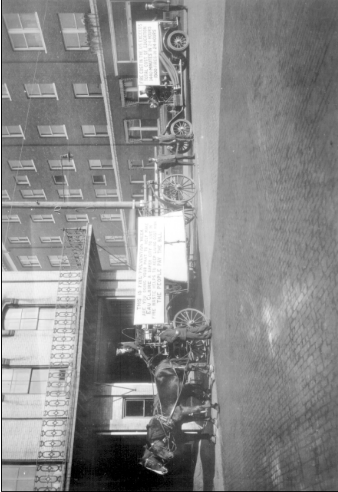
The Eau Claire fire station in 1925. Notice the two fire “trucks,” one still pulled by horses. Read the signs in the photograph. What special week are the firemen promoting?